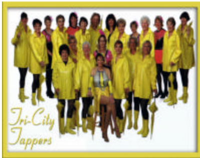
Tri-City Tappers, December 1 NARFE Chapter 1192 Meeting!